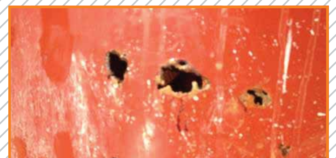
Rust that affects integrity of container