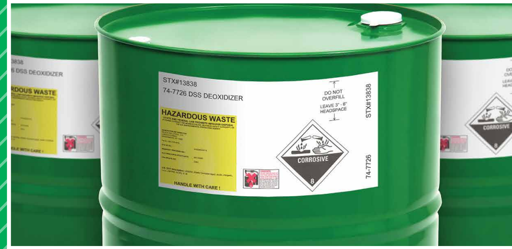
Labels in good condition, legible and not faded