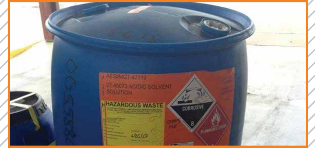
Top and bottom of drum is bulging due to pressure build up