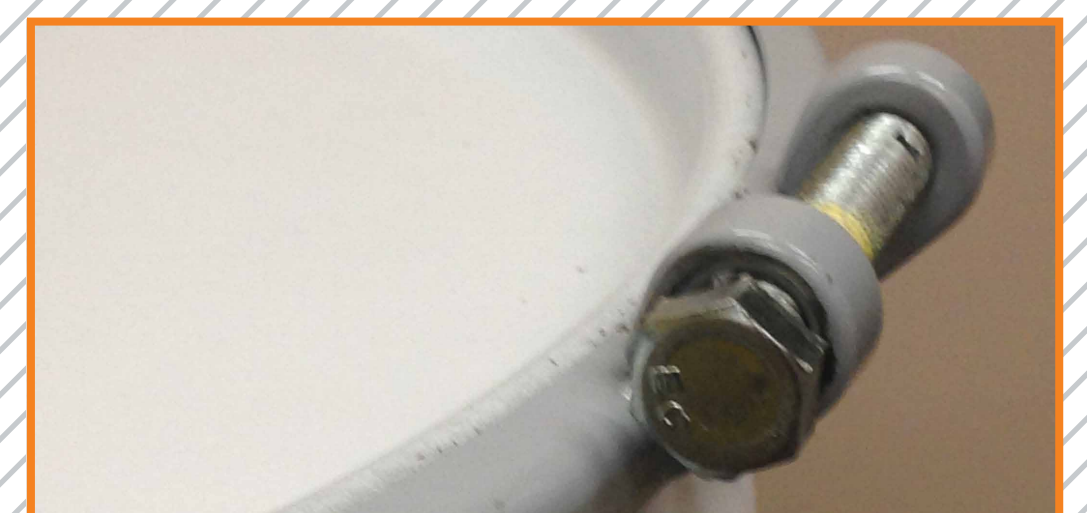
Bolt rings in up position and not tightened to specifications