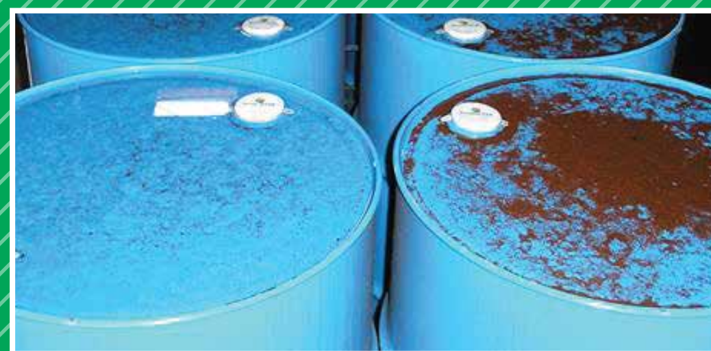
Surface rust is acceptable