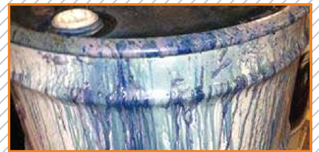
Hazardous material adhering to outside of container