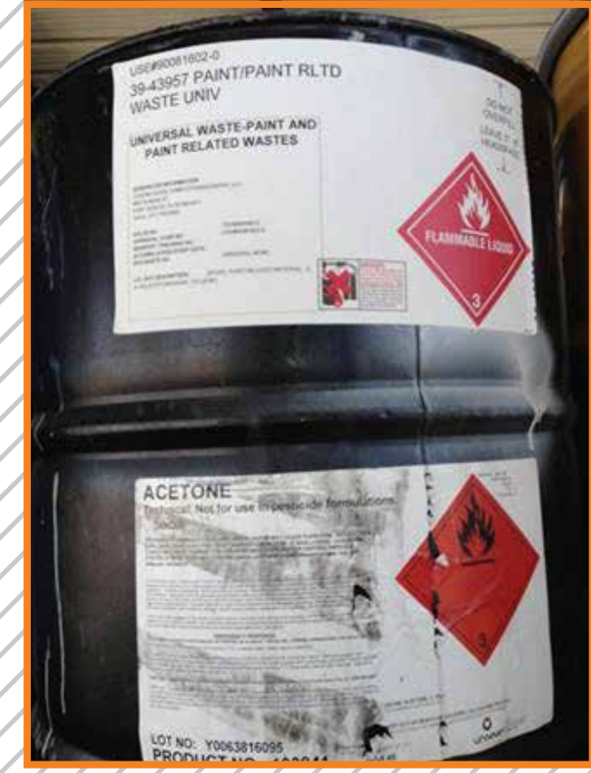
Previous labels/markings not removed or covered