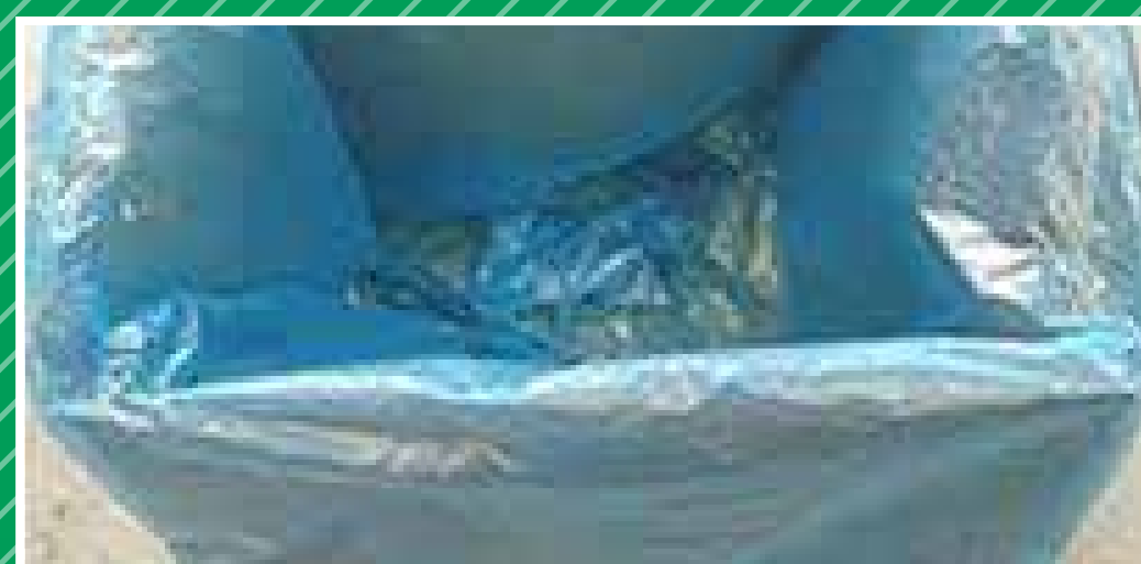
Must use liner in package