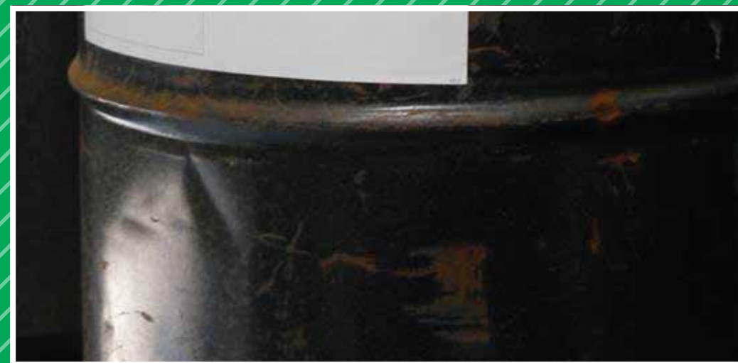
Small "door ding" dents are OK