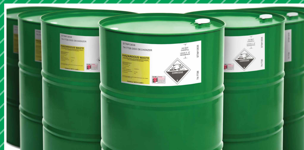
Top of drum is level and the bottom is resting flat