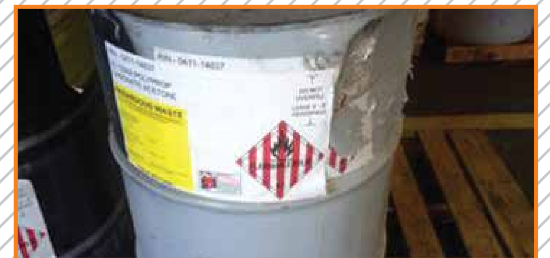
Large dents that affect integrity of the container